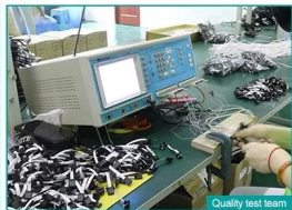
Quality test team