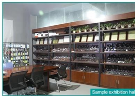
Sample exhibition hall