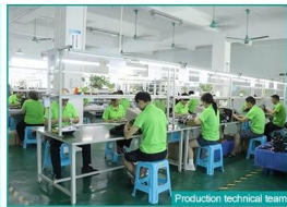
Production technical team