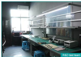
R&D test team